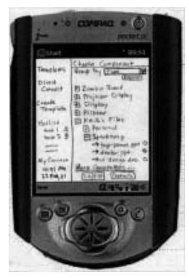
Figure 2: An early, low-fidelity sketch of one of the screens for the Speakeasy Browser. The sketch was drawn inside a photocopy of a Compaq iPAQ PDA, and shows an earlier version of the screen shown in Figure 1

We began our design exploration with sketches on paper (see Figure 2) to outline core aspects of the browser's functionality, such as finding, connecting, and controlling components, as well as the notions of