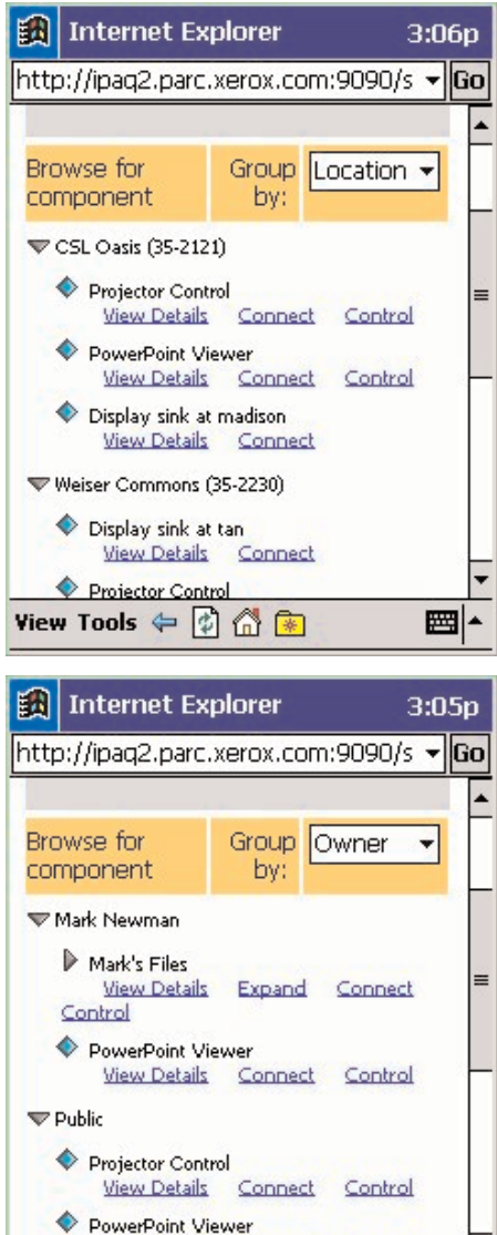
shown here grouped by location (above) and owner (below)

While the browser's direct connection mode provides "raw" access to compo-