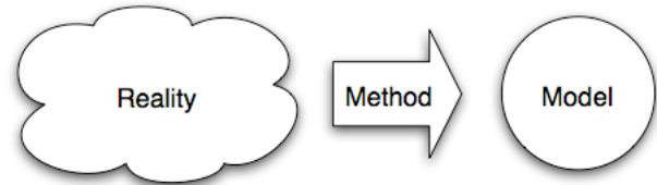
Figure 1: scientific process

Besides the workshop title, the description also states that the workshop will focus on design methodology and that it will “make a contribution to the establishment of design as a science.” While the definition of a design science is a noble goal, the method chosen appears flawed. Science consists of a method to observe and abstract reality into models that are then used to explain and predict reality (see Figure 1). Newton’s law of gravity, for example, explains why an apple hit Isaac Newton and it also helps us to predict the position of the planets in the future. The various sciences claim certain parts of reality as their phenomena under investigation.